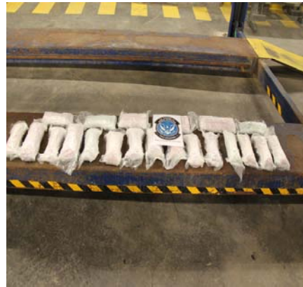
72,000 Ecstasy Pills Seized